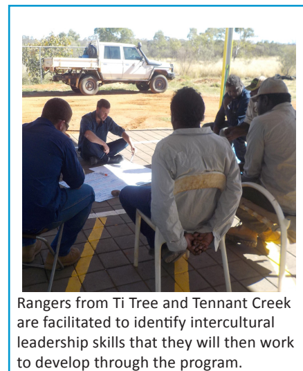
Rangers from Ti Tree and Tennant Creek are facilitated to identify intercultural leadership skills that they will then work to develop through the program.

DKA continued to implement a program working with Indigenous Rangers focusing on intercultural leadership skills in partnership with the Central Land Council and Central Desert Native Title Services, and Ranger teams from Tennant Creek and Ti Tree in the NT and Kiwirrkurra in W.A. Workshops were held throughout the year to identify skills development needs, and activities that would develop the skills. DKA facilitated the Rangers, with guidance from Traditional Owners to create project plans around the activities, which will be delivered and evaluated throughout 2016-17.