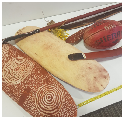
Props used in the 'Codes for Life' workshop included a shield, coolamon, boomerangs, spears, a payback spear, an AFL football and a measuring tape.

DKA also trialled an intercultural program in late 2015 called 'Codes for Life', which focused on building Aboriginal men's capacity to assume their social responsibilities through better understanding of the multiple cultural codes that affect them, including sporting codes. The success of the workshop was the basis for securing funding to continue to trial the approach in 2016-17 in Alice Springs and Tennant Creek.